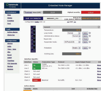
Fig. 3 The Element Node Management interface

The Element Node Management software resides on the NMB and is used as a node manager and/or a transfer agent to higher level network management systems by using industry standard SNMP as the network management protocol. The NMB presents the node information with graphic elements and easy data overview in a standard web browser. For advanced fault tracing or configuration, data is presented in data logs with date and time stamps. For remote access, embedded management channel with IP connectivity can be configured between the two nodes.