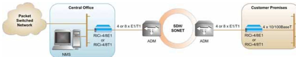
Figure 2. RICI-4E1/T1, RICI-8E1/T1 Extends Ethernet Services over Multiple E1/T1Circuits

RICI-4E1 RICI-4E1/U RICI-4T1 RICI-8E1 RICI-8E1/U RICI-8T1