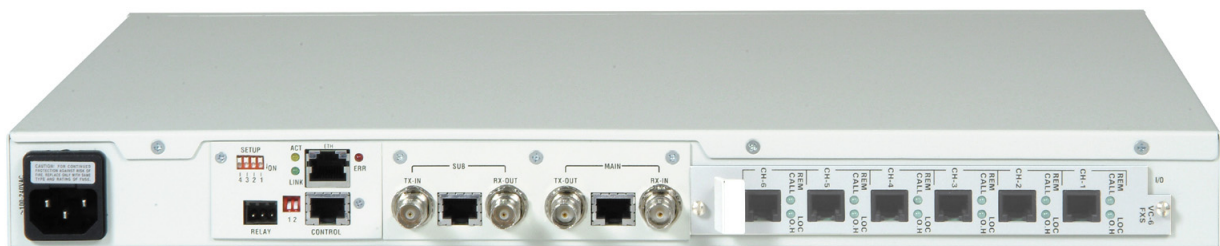
FCD-E1M Rear Panel